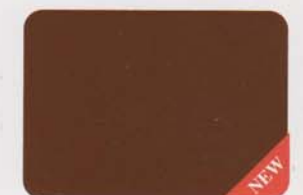
Pecan Pie RC - 566

ROFCOAT. EXTERIOR SEMI-GLOSS ROOF COATING.